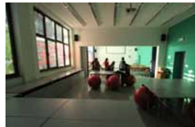
Didactic Center of Nova Gorica