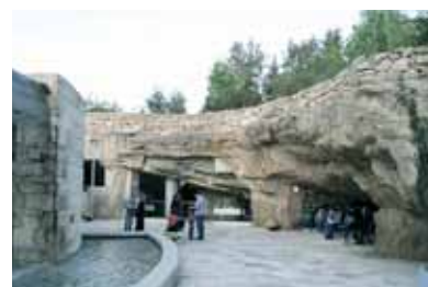
Didactic Center of Strovolos