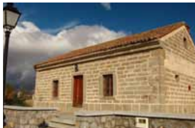
Didactic Center of Avila