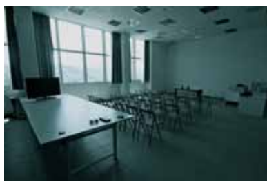
Didactic Center of Teramo